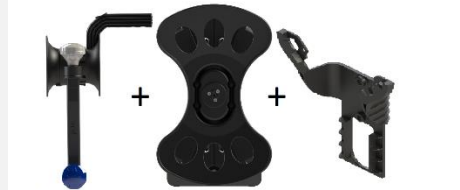
Cord Guide/Winder + Storage Cassette Reel + Wall Storage Mount